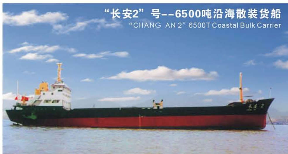
“长安2”号--6500吨沿海散装货船 “CHANG AN 2” 6500T Coastal Bulk Carrier