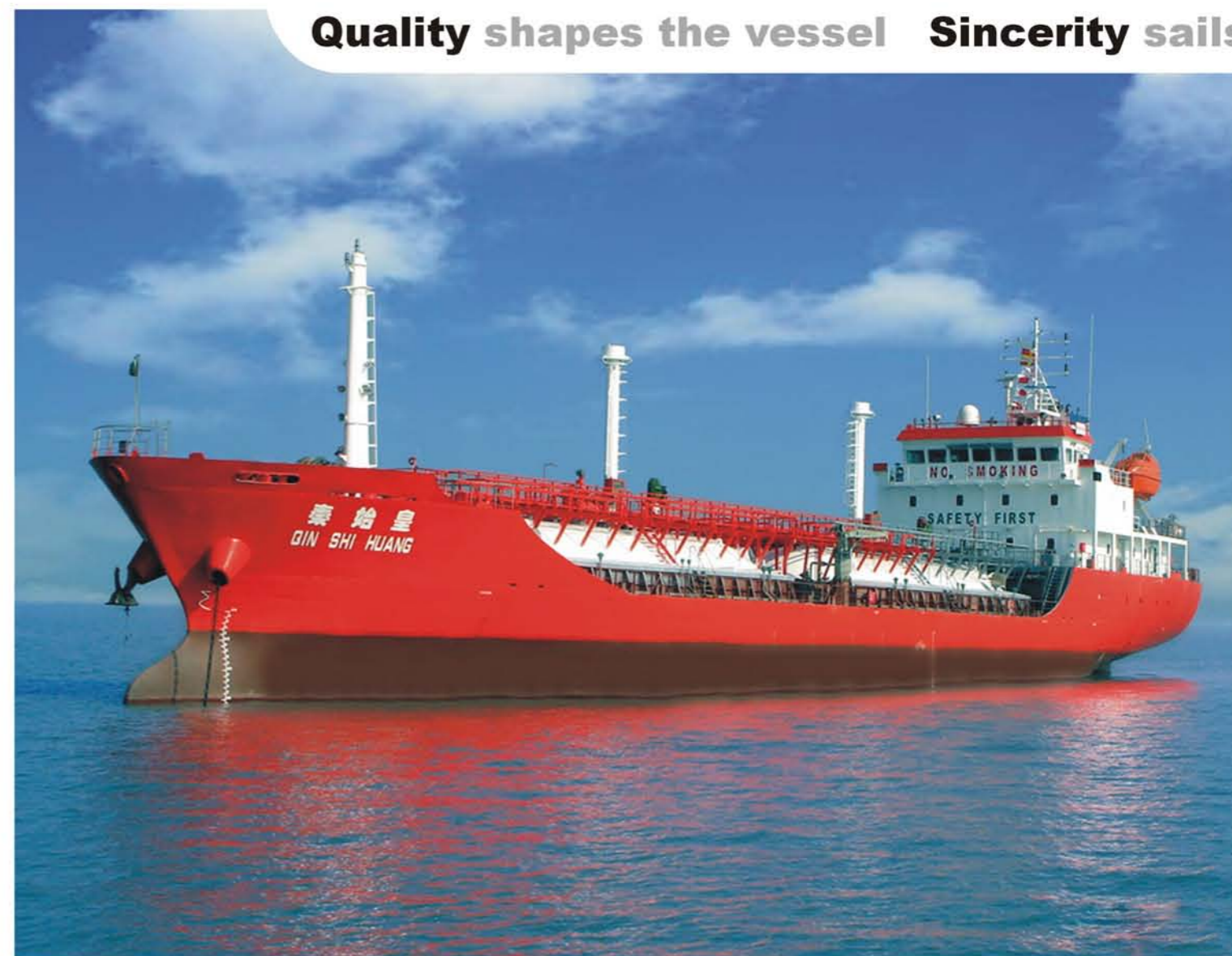
“秦始皇”号-- 3200立方米LPG “QIN SHI HUANG” 3200M 3 LPG Carrier

Quality shapes the vessel Sincerity sails