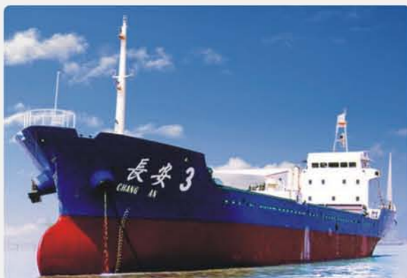
“长安3”号--6500吨散集两用船 “CHANG AN 3” 6500T Bulk & Container Carrier