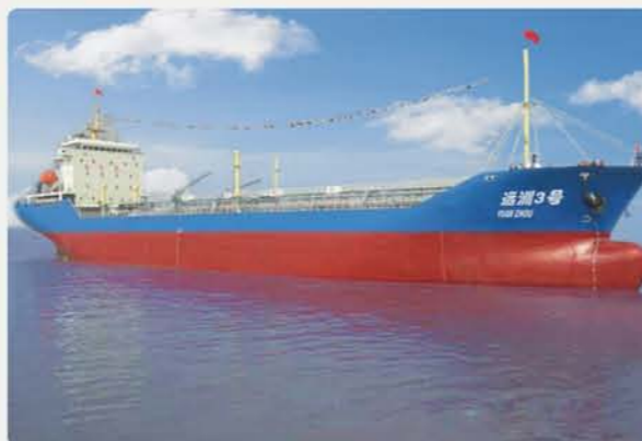
“远洲3”号--12600T油轮 “YUAN ZHOU 3” 12600T Tanker