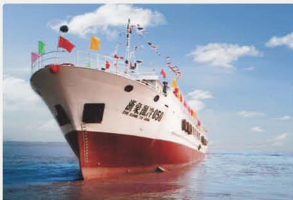
“浙象渔冷050”号--冷藏冷冻渔运船 “ZHE XIANG YU LENG 050” Refrigerated Fish Carrier