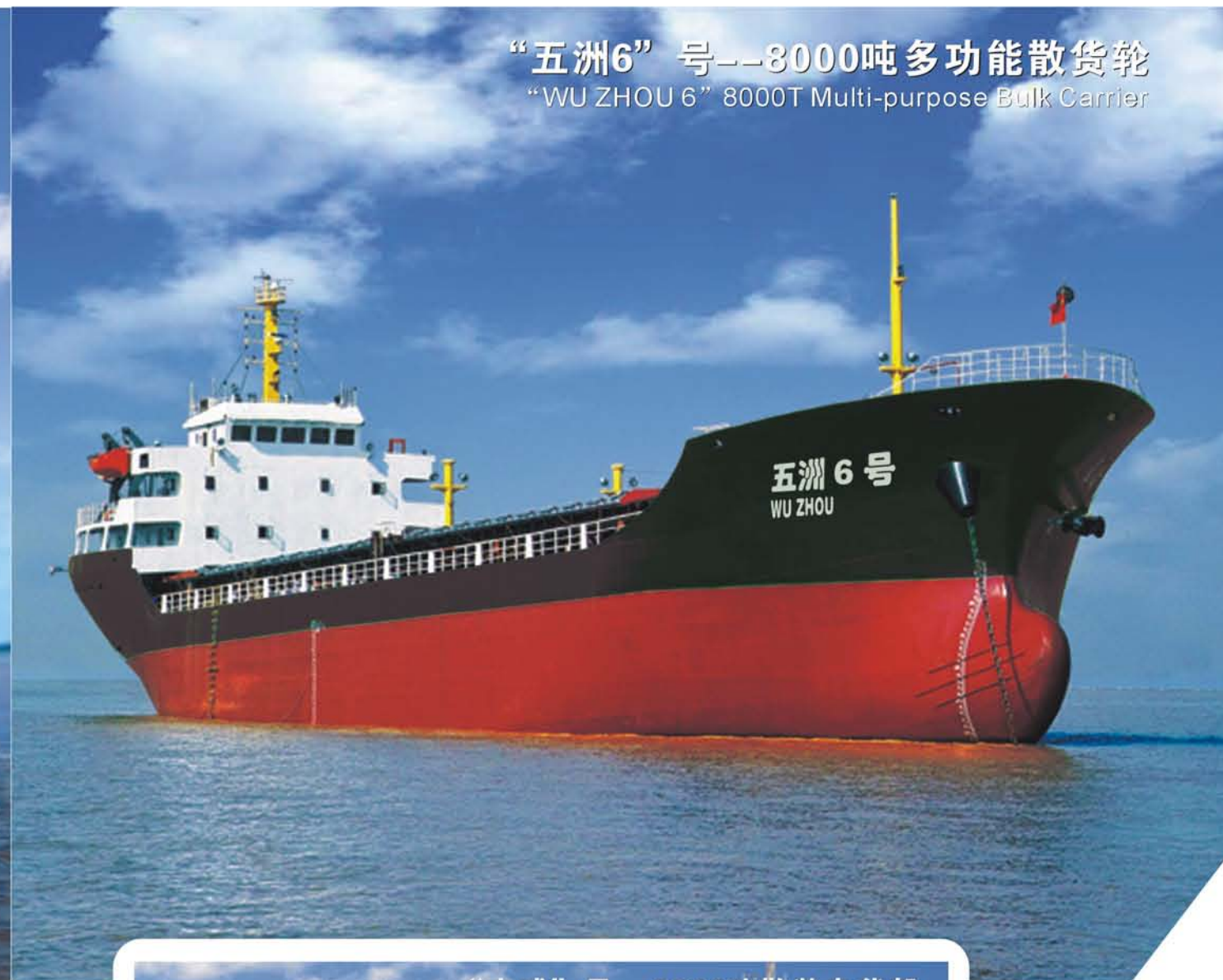
“五洲6”号--8000吨多功能散货轮 “WU ZHOU 6” 8000T Multi-purpose Bulk Carrier