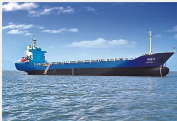
“中远2”号--648TEU集装箱船 “ZHONG YUAN 2” 648TEU Container Vessel