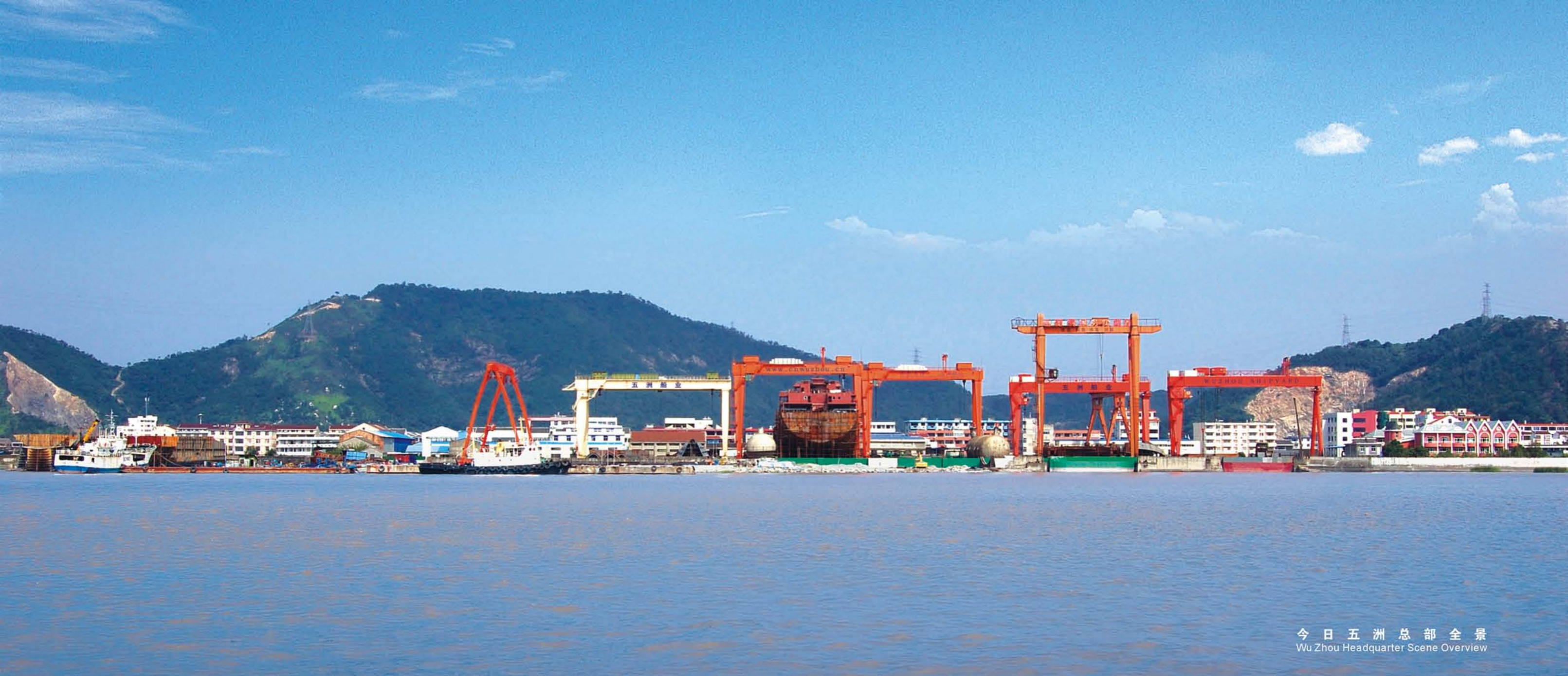
今日五洲总部全景 Wu Zhou Headquarter Scene Overview