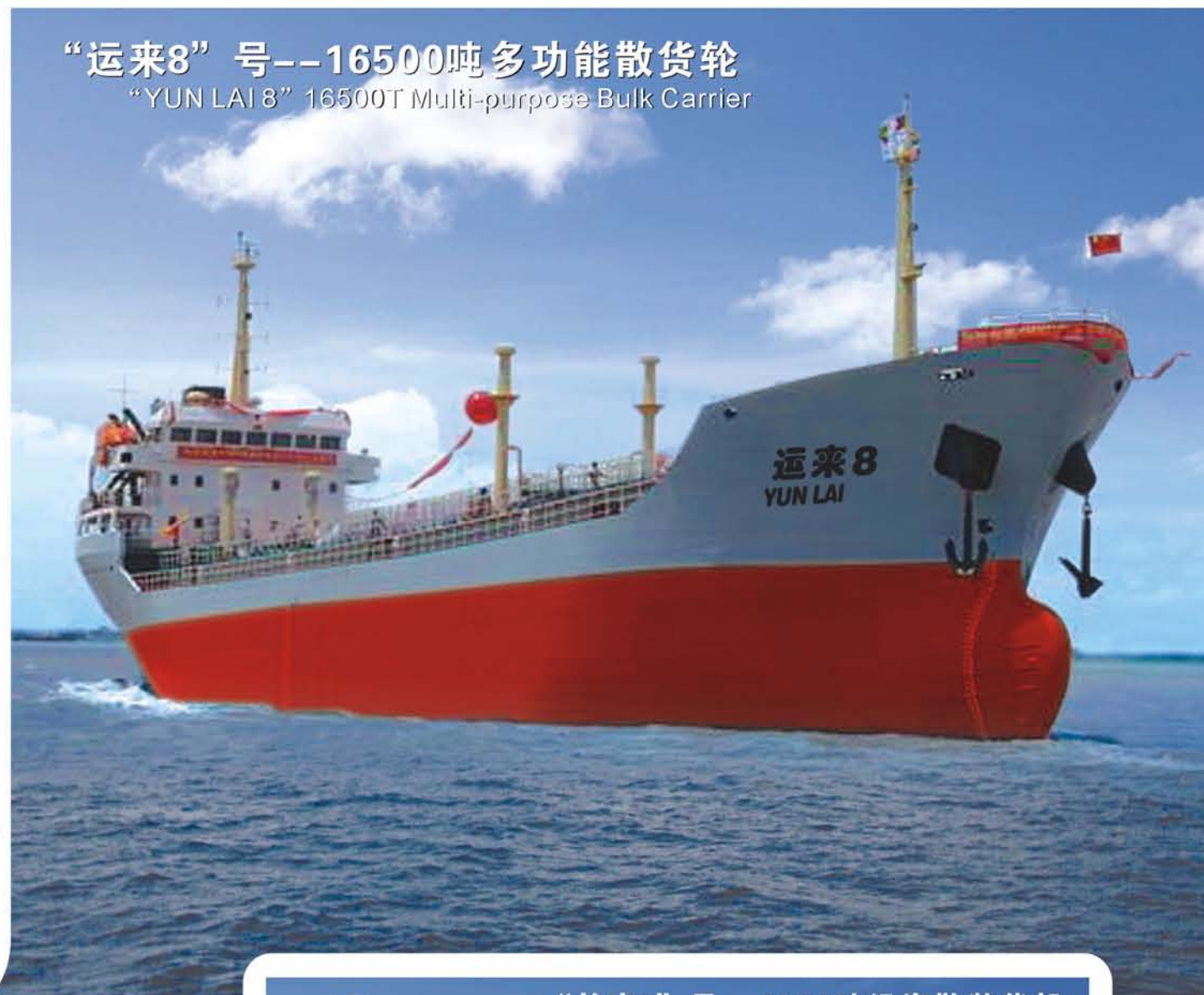
“运来8”号--16500吨多功能散货轮 “YUN LAI 8” 16500T Multi-purpose Bulk Carrier